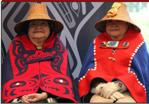
Leadership and Direction