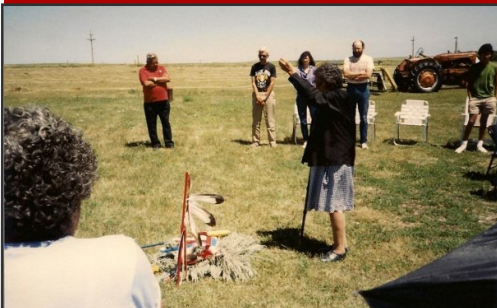
Our "Old Testament"