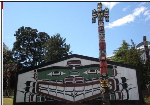
The Big House