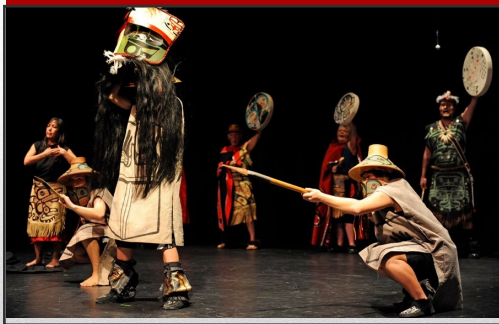
Life in The Sacred-