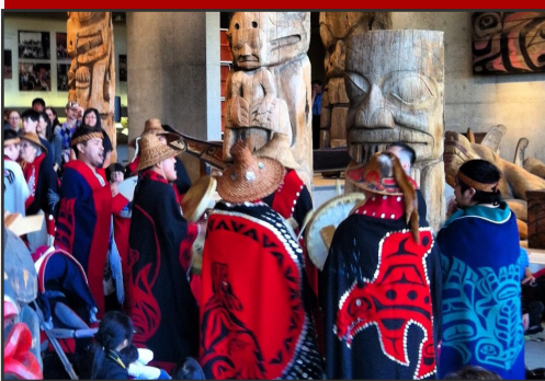
Unity and Strength