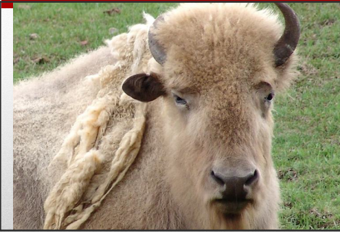
Pte San: The White Buffalo