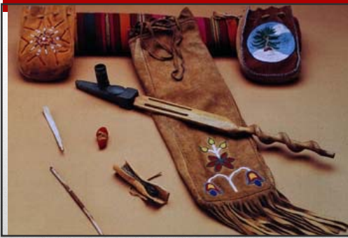
The Sacred Pipe