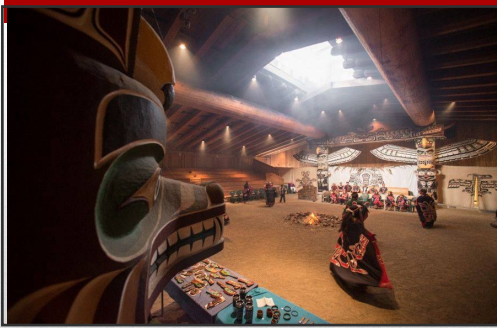
The Crest and Potlatch