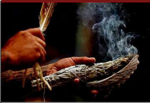
Azilya- a medicine