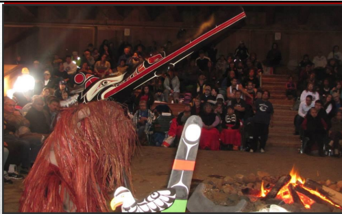
Coastal "Old Testament"