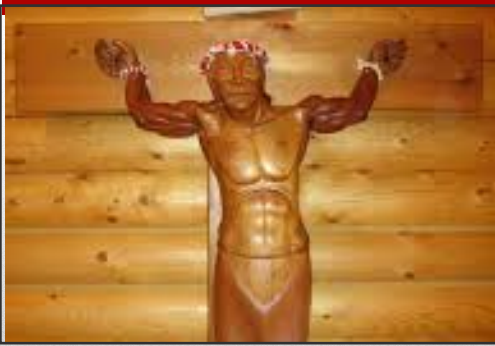
Who is Jesus?