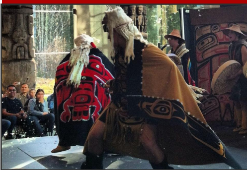
Identity and place